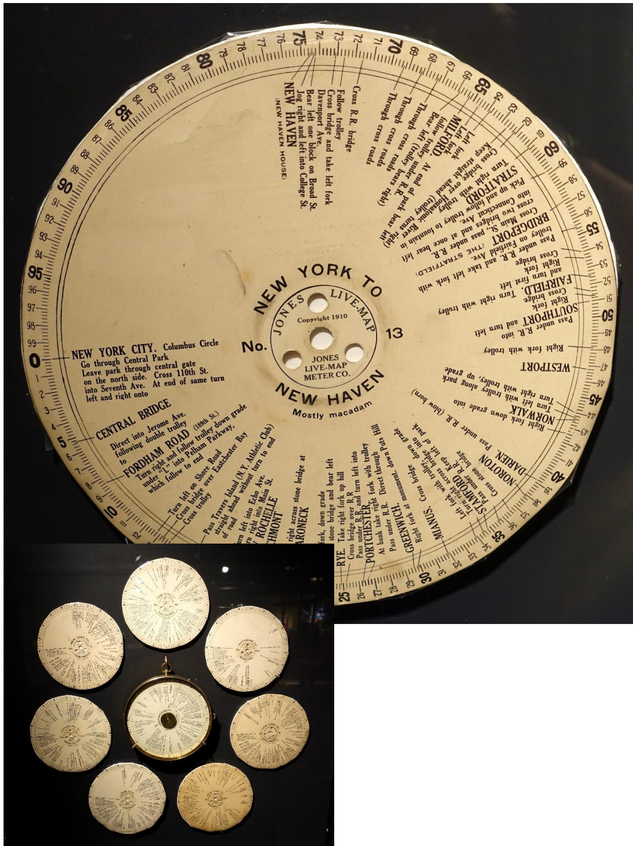
Exhibit in the Museum of Science and Industry, Chicago, Illinois, USA