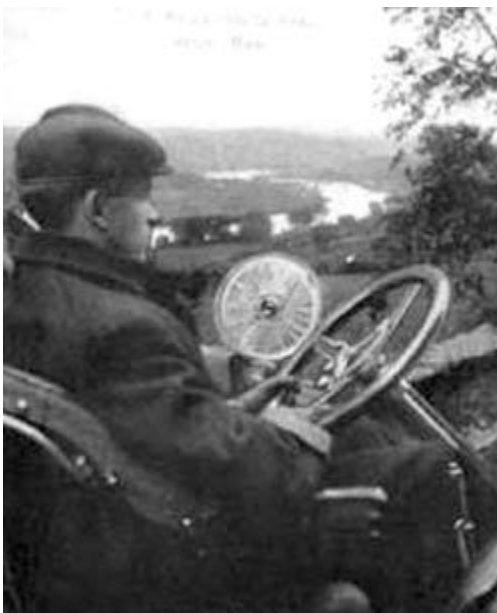
A motorist uses this high-tech alternative to maps.

As if this wasn't enough discouragement, there was the challenge of navigating. Road signs were rare and often incorrect. Travelers were frequently reduced to driving from one roadside stranger to the next, gathering a few miles of directions at a time. The earliest road maps by Rand McNally were printed only after 1904.